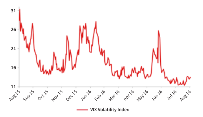
Figure 2: Twelve month market volatility troughs in August

The recovery in UK markets following the immediate post Brexit declines continued through the month and sterling was broadly stable against currencies, other than the US dollar. UK economic data was also reassuring, showing resilient consumer spending and strong retail sales in July. The manufacturing Purchasing Managers' Index, which fell sharply in July as businesses worried about the period of uncertainty ahead, bounced back in August, posting the biggest monthly gain on record. The 11.7% fall in sterling, on a trade weighted basis since the referendum, is undoubtedly helping exporters and supporting confidence, as is the firm resolve of the government under new Prime Minister Theresa May.