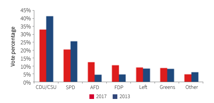
Figure 3: German Federal Election results; 2017 vs 2013