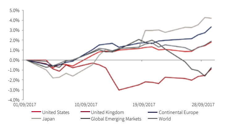
Figure 1: Major Equity indices returns

Global government bonds retreated -1.1%, whilst global bonds fell -0.8% as investors' risk appetite returned. UK government bonds sold off heavily during the month, ending 2.7% down after particularly hawkish rhetoric by the Bank of England, suggesting a rate rise before year-end. Sterling notably appreciated versus the US Dollar, rising 3.7%, partially contributing to the 0.8% fall in UK equities. In commodities the most notable move was in oil with Brent crude rising 9.9%, reversing sharp year-to-date losses. This price reversal follows an apparent peak in supply surpluses combined with rising demand forecasts.