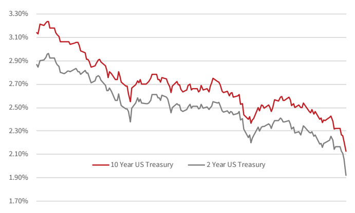
Figure 1.2: The 10 Year Treasury yield has fallen one percentage point over the past 7 months

However, while recent leading indicators globally of trade, manufacturing and industrial production have generally been weak, the key service sector has remained buoyant and employment has been strong, pointing to sufficient momentum to keep the economic expansion intact, albeit at relatively subdued levels. With inflation subdued central banks have considerable flexibility in keeping policy ultra loose, and even looser should current low levels of inflation prove intractable. Furthermore, the extent of the falls in government bond yields and the impact on financial conditions and valuations of other markets should not be under-estimated: US bond yields have fallen by a full one percentage point over the past 7 months. This provides a strong underpinning to equities and other risk assets, offsetting the more challenging conditions faced by the corporate sector after last year's benign backdrop.