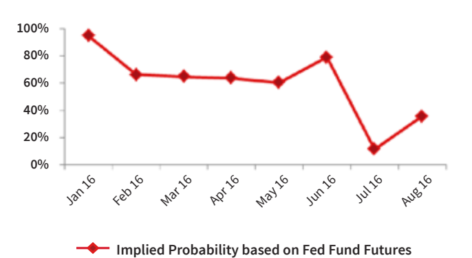
Figure 2: Probability of a Fed Rate hike in 2016

Aside from the substantial fall in bond yields over the past 6 weeks, one of the most notable moves has been the sharp fall in the oil price, now down by 20% since its peak in early June and back to close to $40 per barrel. Prices are somewhat supported by falling global production, but the headwinds of high stock levels and falling production costs in the US force a cap on the price - which seems set to trade in a range around $40-50 for some time ahead.